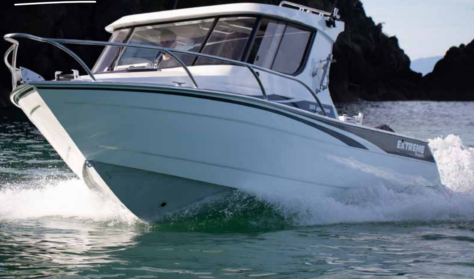
The wide flat chines taper well toward the fine-entry bow.

positions, so you can get yourself set up the way you want for the sea conditions. I liked the bolster style, and when I did go back to the seated position, I found the helm, controls and footrest were all correctly placed. No matter what driving position you choose, the visibility is excellent all around and the seating comfortable.