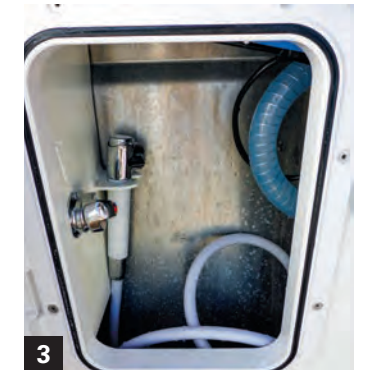
1) The galley includes a two-burner hob and freshwater system. 2) Two rear windows recess into the bulkhead; rearfacing bench seats are ideal for watching lures. 3) A pull out hot and cold freshwater shower is fitted in the cockpit.

water heater) has been fitted and is plumbed up to a pull-out shower nozzle out in the cockpit and a stainless sink back in the galley, which sits alongside a two-burner gas stove and three storage drawers. Under the passenger seat is a fridge.