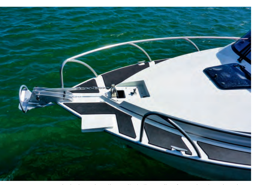
Towards the bow, the rails are dissimilar to allow for an electric outboard mount.

topped off with grab rails in front of the dash and under the roof.