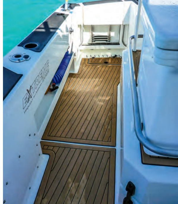
SeaDek faux teak decking and charcoal gunwale covers add class - and good footing to the boat.