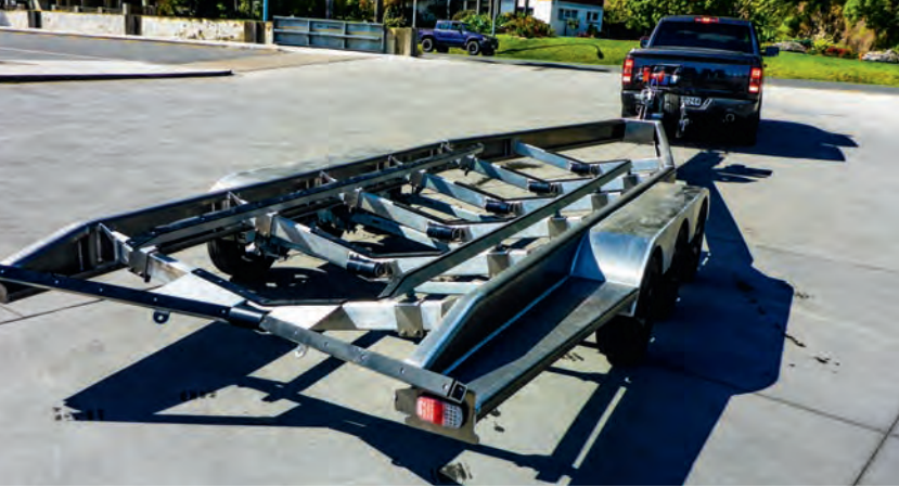
GFAB built the alloy trailer. It's designed for drive-on, drive-off retrieving and launching with keel rollers, bunk and skids.

a 70mm coupling/tow ball combination rated up to six tonnes. A towing weight was not supplied as this is variable, depending on the specifications of the build.