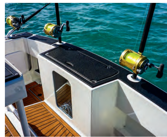
Left to right: A 185-litre Icey Tech bin is mounted on the engine box for catch stowage; A custom removable bait and filleting station can be worked from both sides of the cockpit and features two removable cutting boards that run off to a central drain, which can be removed for emptying and washing; A livebait tank with in-built tuna tubes is fitted to the transom but still leaves walk-around space.